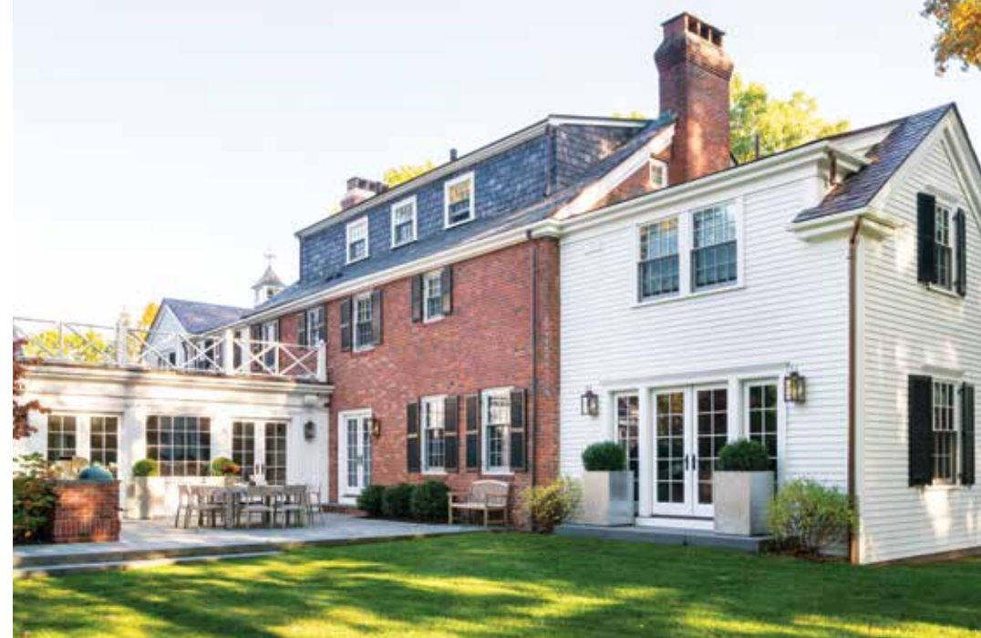
CLOCKWISE FROM LEFT: Tucked in the half-story above the game room, a sparkling new bath connects directly to the primary bedroom in the original section of the house. Behind the house, the new wing comprising the kitchen and family room anchors a patio equipped with a grill, smoker, and dining area. Local brickmakers are experts at sourcing replicas of original bricks, says builder Jack Sullivan, but matching mortar is even more important to disguising new features and additions on an older home.