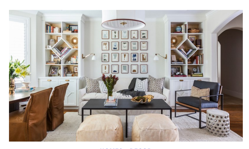
HOMES + DECOR