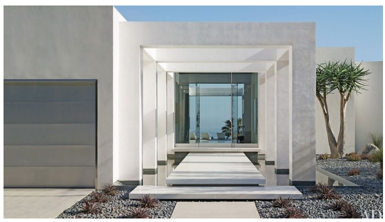
HOMES + DECOR

11 Pared-Down Examples of Minimalist Living